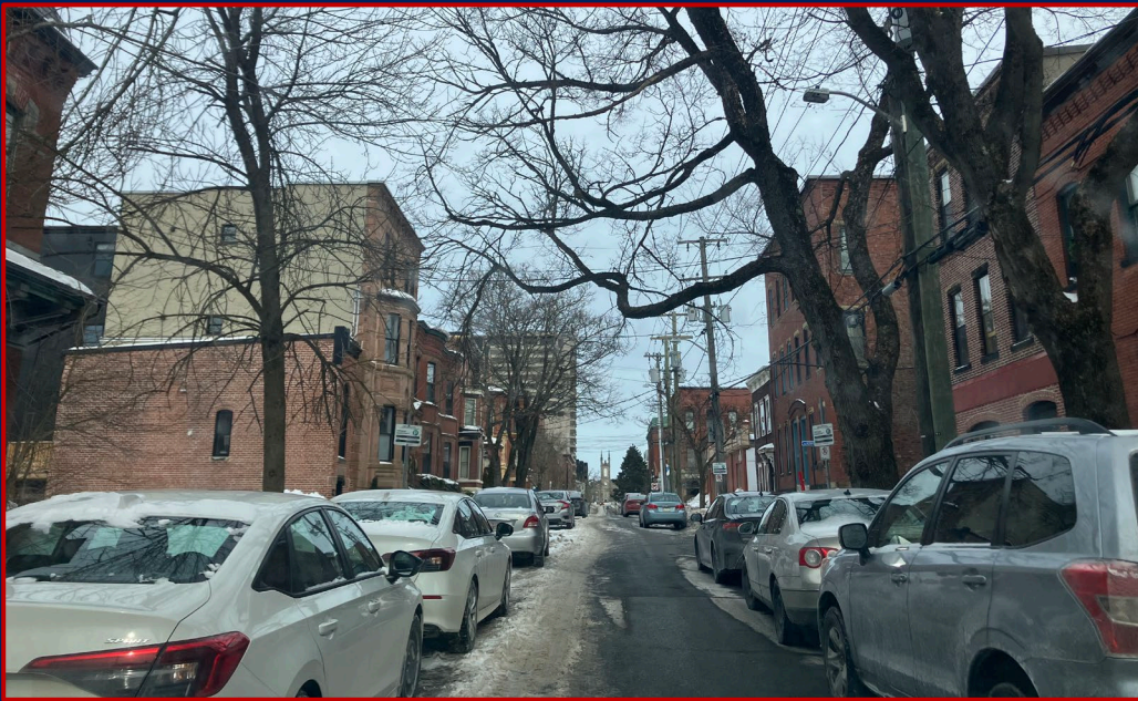
Illegal parking on one side of Germain Street