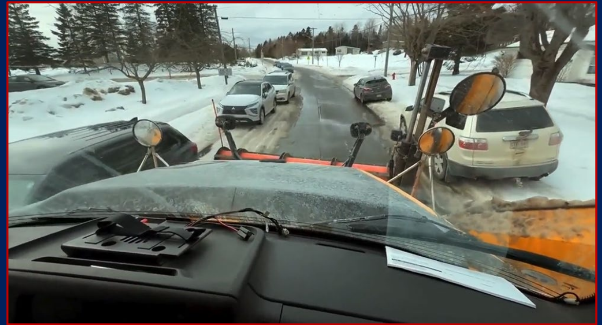
City street plow attempting to operate between parked vehicles