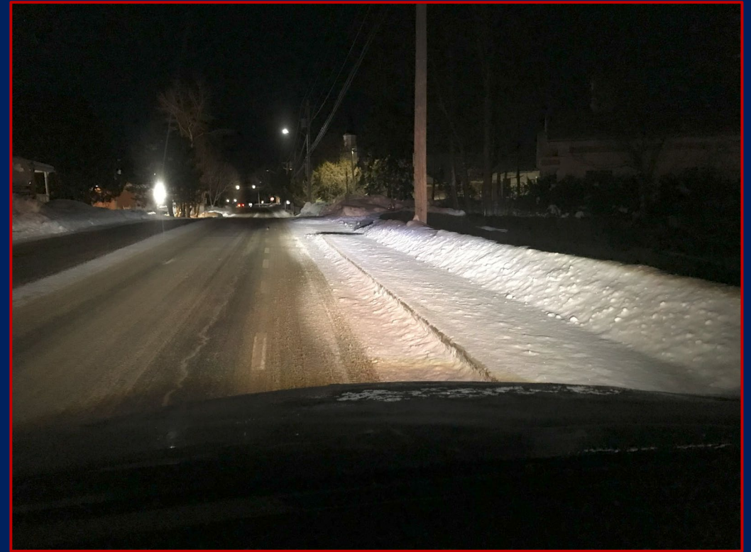
Plowing sidewalk first with street plow wing