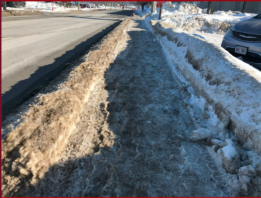
Plowing sidewalk with smaller sidewalk plow